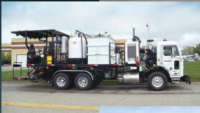
● Model 1 - 900