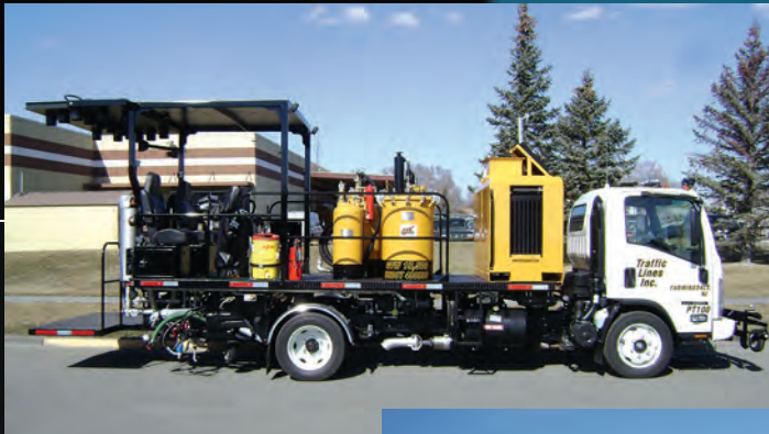
● Model 1 - 90

Is offered in a POWERFUL selection of models.