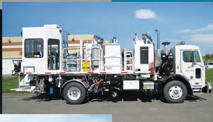
Model 1 - 160 ●