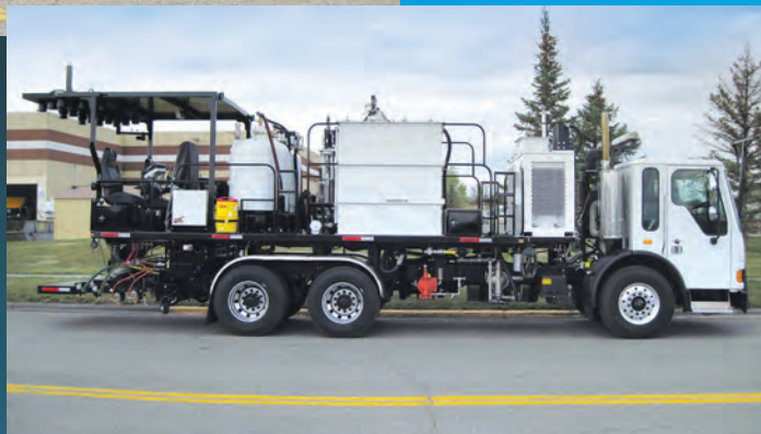
Model 1 - 1200 ●